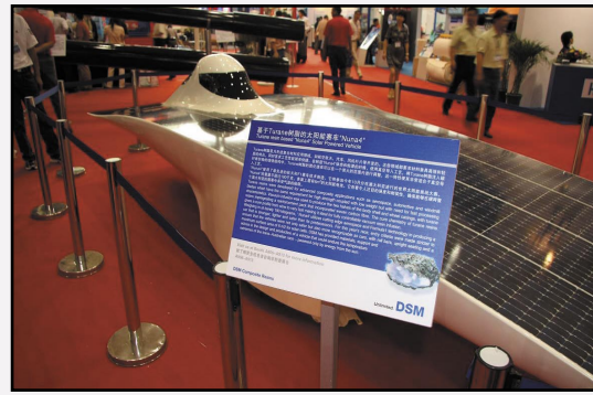
The replica at The 13th China International Composites Industrial Technical Expo