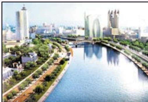
City of Tianjin.