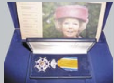
Box with the decoration and Gazette