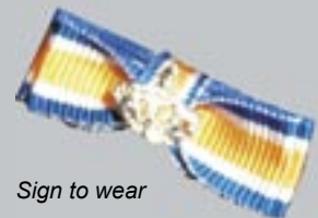
Sign to wear